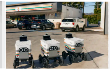
Robot Deliver to Car

Re-route to out of network cash-pay Telehealth